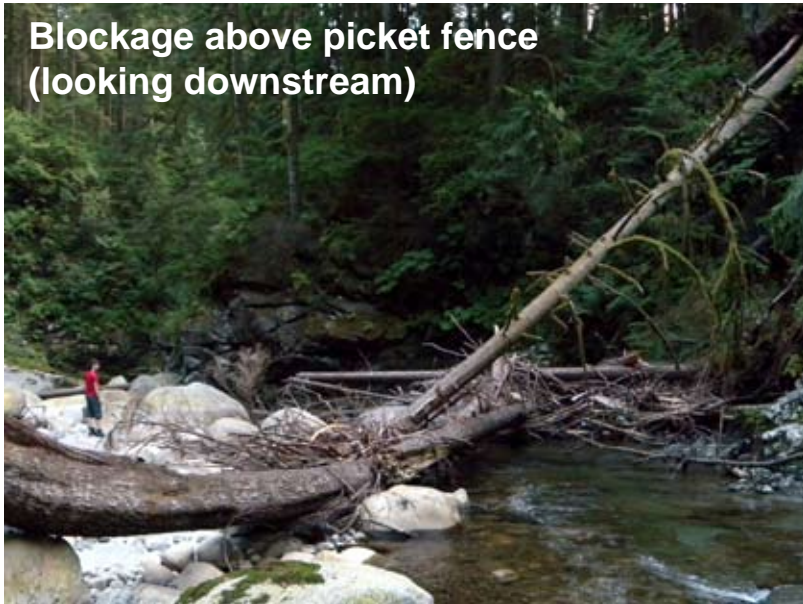
Blockage above picket fence (looking downstream)

To finish off our tour, we hiked around to the exit of the slot canyon and found the huge log that was hanging above the creek now had a twin at water level. Suffice it to say that these logs and most of the wood upstream will be around for a while and probably only get worse before an enormous flood cleans out Lynn Creek. Pray for rain! For more pictures, see my album on the VKC Gallery.