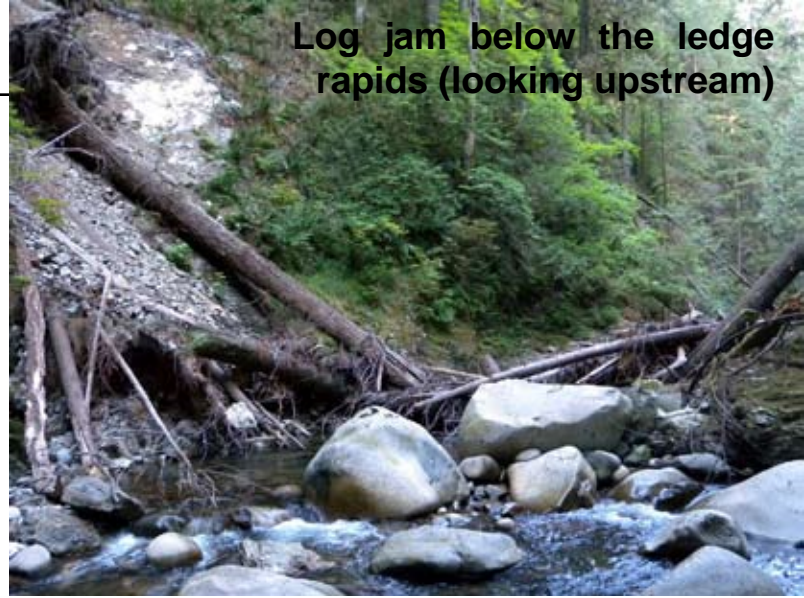
Log jam below the ledge rapids (looking upstream)

ledge drops appeared to be fairly clean. Our next opportunity to get to the creek bed was down a steep route which took us to the upper bend above House Rock.