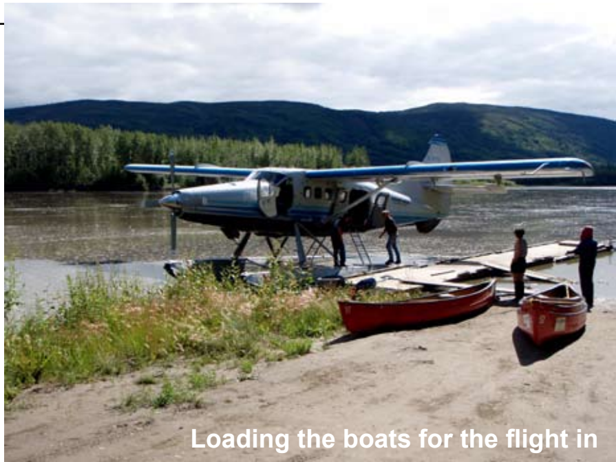
Loading the boats for the flight in