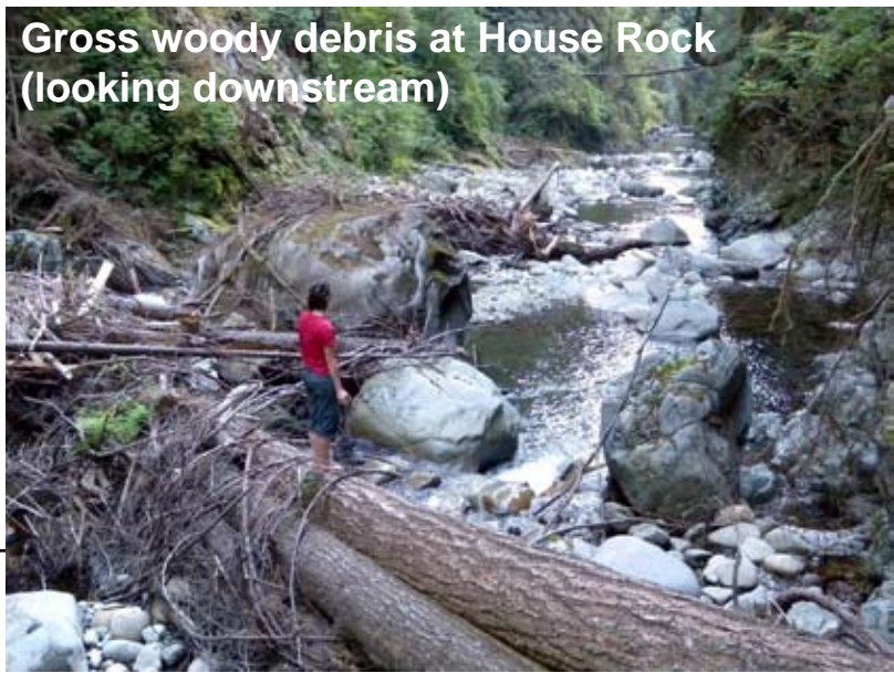
Gross woody debris at House Rock (looking downstream)

By the time we got to House Rock, I thought that I had an idea of what to expect. In January 2007, Keith and I came across a pair of small trees blocking both sides of House Rock. We were able to portage on river left that day and the trees were eventually flushed out with high water. The situation this time was much worse, however, as another landslide on river right