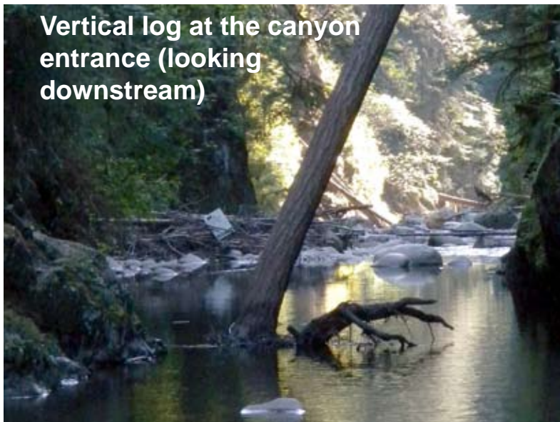
Vertical log at the canyon entrance (looking downstream)

We soon realized that the trail does not actually follow the canyon edge, but turns away from the creek to climb along a ridge above the steep slope ascending from the canyon wall. In order to see more of what lay in the creek below, we decided to leave the trail and bushwhack along the lip of the canyon. Although there were not many chances to peer into the creek, we did manage to see that the