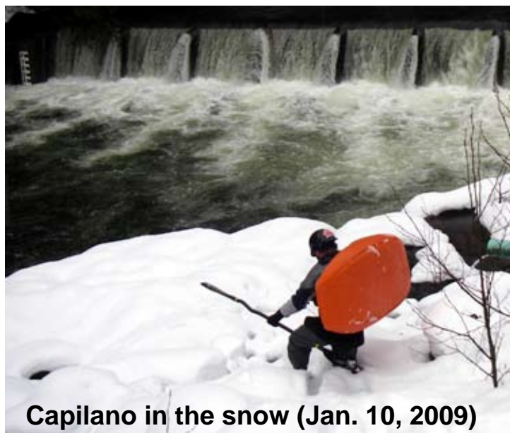
Capilano in the snow (Jan. 10, 2009)

The date was January 10, 2009. With the holiday season over and plenty of spare calories to burn, a group of five paddlers ventured into Lynn Creek. Thankfully, I was not one of them. The journey began as one might expect for winter paddling on the North Shore. In the words of Matthew, "the snow covered walk in trail covered with fallen trees was just the start of the day." There was actually a fair amount of snow on the ground, as can be seen in the picture taken at the Capilano River put in on the same day. After getting themselves nicely settled down inside Lynn Canyon, the fabulous five found conditions on the water not unlike that of the walk in. Keith later wrote that it was the worst he has seen and Annie, putting it bluntly, announced that "the Lynn is f****d and will be for a while." A more accurate statement could not have been made, although uncovering the blank letters would be slightly more effective because the Lynn is indeed filled - with trees!