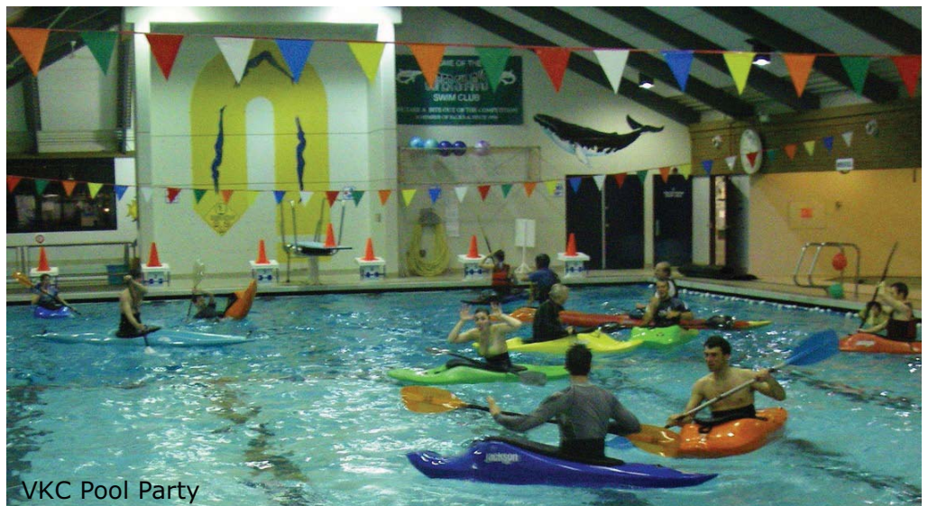
VKC Pool Party

In what was supposed to be a casual match of kayak polo, the orange boat team was struck down with agonizing defeat after ten minutes of fierce competition. With very little energy left, all boaters were then lined up at one end of